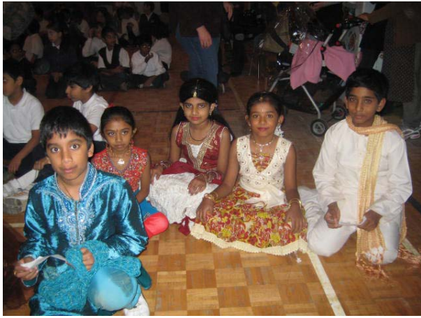
Diwali at Sinclair Laird.