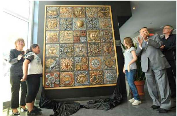
The Gerald McShane-  coles Jules Verne mural.

GERALD MCSHANE: The inspiring Mural of Hope, produced by Gerald McShane Elementary School in Montreal North, took top prize in the teaching category at the Transcontinental Communications Gala Awards ceremony Nov. 12.