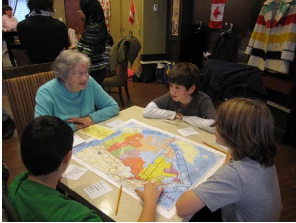
Students and residents enjoy the Canada Game.