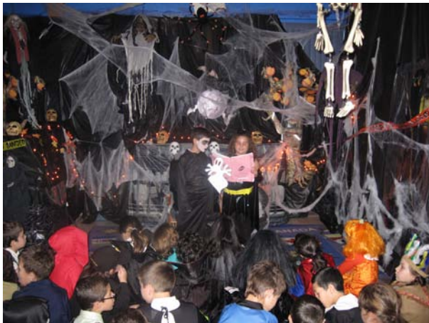
Halloween at Honoré-Mercier.

On the day itself, a Creepy Carnival was organized by our wonderful parent volunteers who turned our gym into a terribly terrifying game zone in the morning and set-up a suitably sinister cemetery to preside over the afternoon's Halloween dance. At the carnival, the kiddies vied for stickers and prizes by giving it their all at each of the seven game stations manned by parent volunteers and student helpers, who played a big role in keeping things organized and moving smoothly. During the afternoon dance, a DJ spun the right tunes and helped the kids bring down the roof with dancing, mixing and mingling!