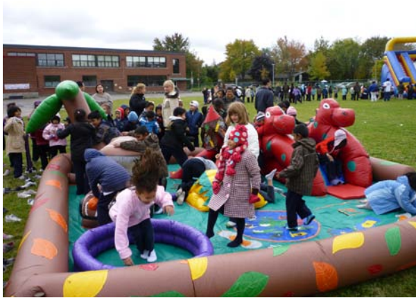
Family Day fun at Parkdale.

FAMILY DAY: The atmosphere was quite festive at Parkdale Elementary School in St. Laurent last month as the students, staff, and parents participated in the first ever Parkdale School Family Day. Everyone was treated to fresh sweet corn, kebab wraps and other snacks and refreshments. Despite the chilly weather the children had a wonderful time playing on the various inflatable rides brought in for them. Children were asked to decorate the brick walls of the schoolyard with posters and drawings, welcoming everyone to this wonderful occasion.