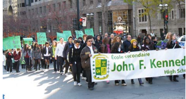
Students from John F. Kennedy High School marched in the Remembrance Day parade.

students. Towards the end of October students from Laurier Macdonald conducted a sit-down interview with some Canadian war veterans. Their topics were WWII, the Holocaust, Bosnia and Herzegovina and Afghanistan.