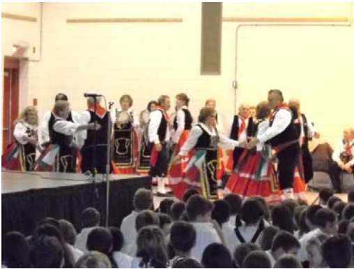
Dancing up a storm at Michelangelo.

with a healthy snack. They were given corn on the cob for lunch and everyone had a good time.