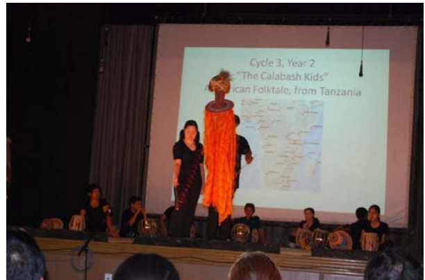
A scene from a Carlyle production.

See the press release on our website for more details.