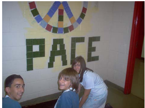
The JPI Mosaic.