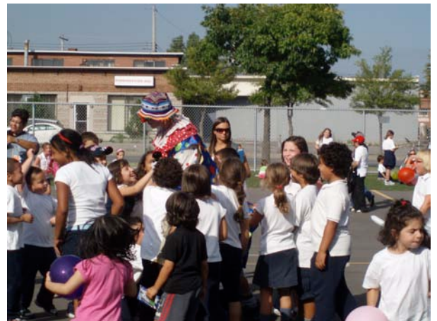
Celebrating at Our Lady of Pompei.