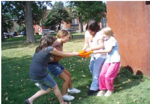
Kids have fun at St. Gabe's.

WELCOME BACK: A number of schools held special events to kick off the academic year.