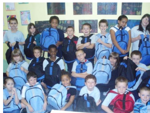
Students display their backpacks.

Staff and students at St. Gabriel celebrated their return with their annual corn roast and fun day. Students had the opportunity to bounce on inflatables, play water games and work in teams to win the amazing race. Geordie Productions performed the dress rehearsal for their new show Story Wars at St. Gabriel School . The show was very entertaining and students from pre-k to Cycle 3 had many laughs. St. Gabriel students were recently given backpacks filled with school supplies from the "Kidfest backpack program," which provides supplies to economically challenged students. Each backpack contained over $100 of materials to help students be more organized and prepared for learning. 4500 backpacks were distributed across Canada through the Kidfest program .