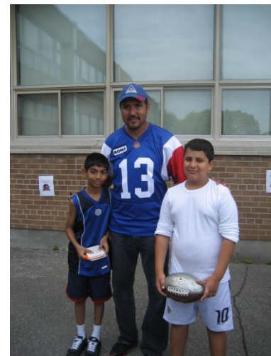
Anthony Calvillo greets students.

For quarterback Calvillo, who spent his time at Cedarcrest answering a myriad of questions and tossing the football around, his visit had an added meaning as his eldest daughter recently began her kindergarten studies at the school. The corn roast was a first for Cedarcrest as beginning with the 2010 – 2011 academic year, the school welcomed many new families due to the debut of a French immersion program which was put in place to better meet the needs of the local community and their students.