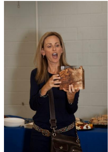
Marlee Matlin accepts a gift.

General Vanier Elementary School in St. Léonard is celebrating its 10 th anniversary this year. The students and teachers are planning a variety of activities throughout the year, including a big birthday party in February with the families of the General Vanier community. On September 10, students and teachers formed a gigantic 10 in the schoolyard as one of their 10 th anniversary celebrations. In the afternoon students were treated to juice and a piece of school birthday cake. As part of the Welcome Back activities, students were treated to corn, pizza, and juice followed by a TCBY treat. It was a fun-filled afternoon, with Hip Hop Dancing and a Magic Show .